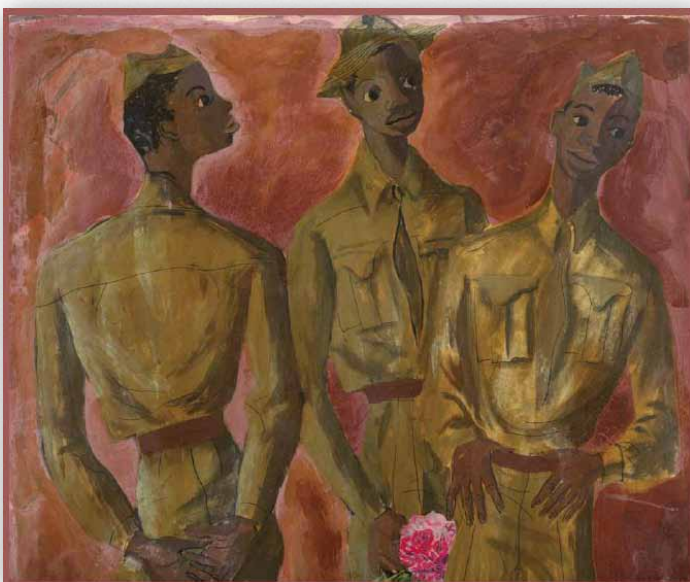
LEFT: Street Scene , 1942, oil on board 44 x 37 cm, photo Grant Hancock