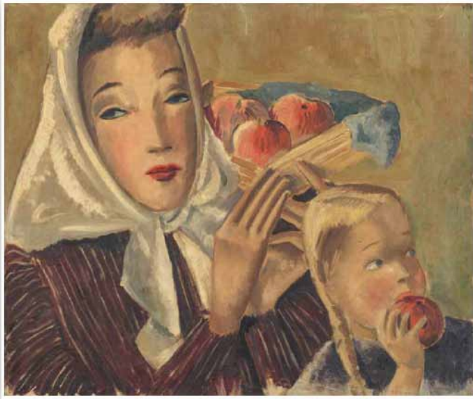
LEFT: German Girls, oil, c. 1937, oil on board, 50 x 60 cm